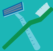
SHARING HYGIENE ITEMS