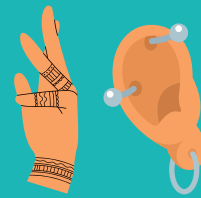
UNSTERILE TATTOO & PIERCING EQUIPMENT