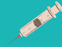
UNSTERILE NEEDLES & HEALTHCARE EQUIPMENT