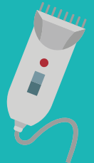
UNSTERILE GROOMING EQUIPMENT

Hepatitis B cannot be transmitted through: