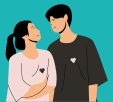
HUGGING OR KISSING

Hepatitis B does not affect only certain people and is not a punishment for bad behavior. Learning your hepatitis B status is important. Know the facts, get tested, and get vaccinated to protect yourself and your loved ones from hepatitis B!