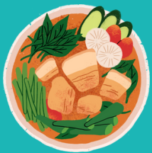
SHARING A MEAL

Hepatitis B cannot be transmitted through: