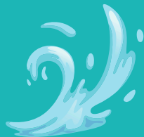
SHARING WATER (CUP OR TOILET)