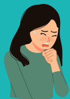
COUGHING OR SNEEZING