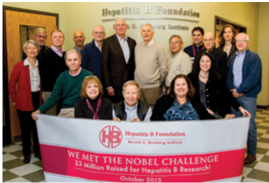
Hepatitis B Foundation Board Directors and senior staff celebrate completing the $3 million Nobel Challenge campaign to fund research at the Baruch S. Blumberg Institute. (November 2015)

The funds are being used to recruit and retain top scientific talent from around the world for the HBF’s Baruch S. Blumberg Institute to accelerate the pace of research for a hepatitis B cure.